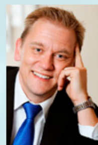
Eppo Bruins STW